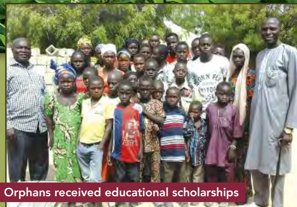
Orphans received educational scholarships