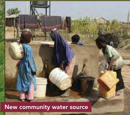
New community water source

The Nigeria crisis erupted in 2009 when Boko Haram burned 59 churches in Maiduguri, including the largest church of Ekklesiyar Yan'uwa a Nigeria (EYN, Church of the Brethren in Nigeria). By 2014 seventy percent of EYN's members were among the millions of people displaced by the escalating crisis. In 2019 Nigerian Christians continue to face extreme persecution. Boko Haram still occupies areas near the Nigeria-Cameroon border and continues its attacks in Northeast Nigeria, where 1.9 million displaced people struggle to survive. Life remains precarious in many areas where EYN members and their neighbors live, with some families even afraid to sleep in their houses at night. Violence has spread further south and west toward the middle part of Nigeria where Fulani herdsman have attacked and burned whole towns, killing thousands. Amid this unstable reality, families still strive to rebuild their lives and support themselves.