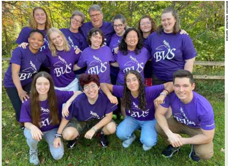
Brethren Volunteer Service

The Office of Peacebuilding and Policy signed a letter to the Senate committee, which was sent jointly by a range of faith-based partner organizations, opposing the version of the NDAA that includes those provisions. The letter urged the committee to “excise concerning provisions to automate Selective Service registration (Sec. 598A of S. 4638 and Sec 531 of H.R. 8070) and to expand registration to women (Sec. 598C of S. 4638).” It continued, in part: “Rather than look towards automation and expansion of Selective Service registration, the time has come to abolish it entirely. . . . [Expanding] draft registration to women, does not represent a move forward for gender equality. Instead, it represents a move backward, imposing on young women a burden that young men have had to bear unjustly for decades—a burden that no young person should be forced to bear.” The letter urged the Senate committee to consider instead a measure to repeal the Military Selective Service Act.