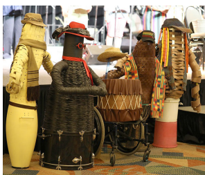
Glimpses of (from left) worship center, musicians, convention center, junior high service project, exhibit hall.

Four wide-ranging recommendations from a task team holding conversations with On Earth Peace were approved. They call for action to address expectations and processes regarding agencies, how Conference decisions and statements are received and implemented, a review of the structure of the Church of the Brethren to address "deep dysfunction," and a time for confession and repentance of how "theological differences around human sexuality have too often been manifested in bullying, violence, and a general sense of dismissal toward one another and specifically toward our LGBTQ+ brothers and sisters," citing James 5:16.