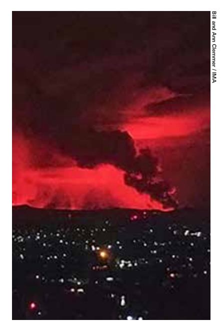
Mount Nyiragongo erupts near Goma, Democratic Republic of Congo.