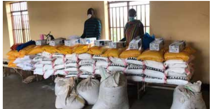
Food distribution through the Rwanda Church of the Brethren.

A grant of $25,000 supported the Church World Service response to Hurricane Dorian in the Bahamas. CWS, working with the ACT Alliance, developed a long-term recovery program for migrants.