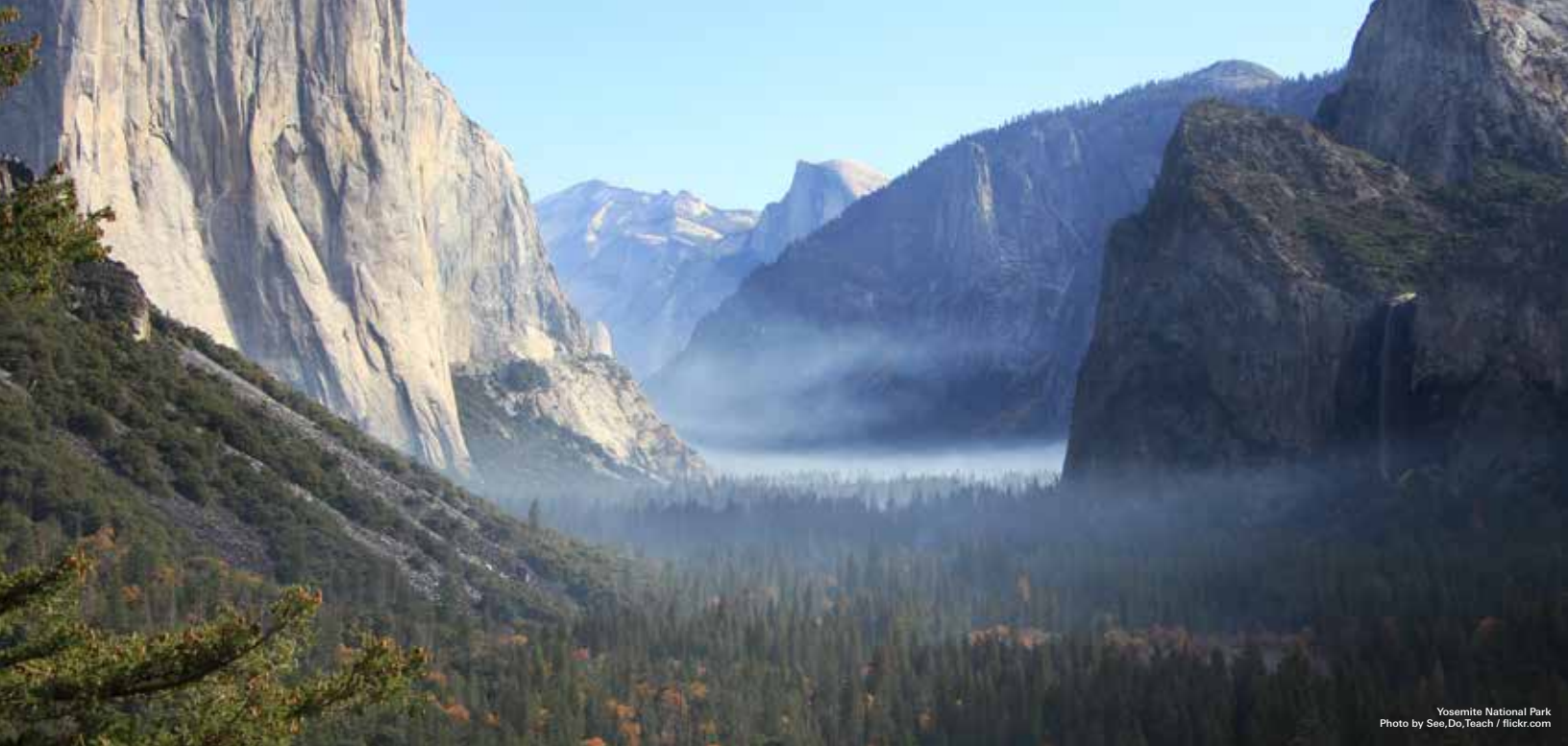
Yosemite National Park

The term gained popularity in the American church following the Revolutionary War as a way of promoting tithing, since the government was no longer a primary funder of church activities. In this context, stewardship took on an economic connotation. It was not until the latter half of the 20th century that the term became more widely used in relation to the environment. Scholars interpreted the creation mandate of Genesis 1:26-28 to be a model of delegated dominion. Humans were to exercise responsible care over the cathedral of creation.