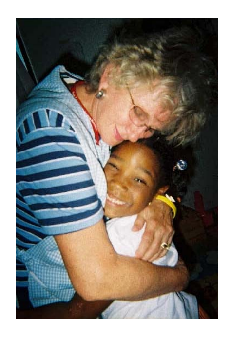
Figure 4. A CDS caregiver hugs a child who was evacuated to Colorado in the aftermath of Hurricane Katrina