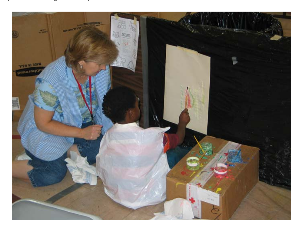
Figure 1. A volunteer sits with a young boy as he paints a picture at a CDS child care center established in Florida after Hurricane Ivan

In the event of a disaster and when a need for child care has been identified, CDS volunteer caregivers from across the country are mobilized and the team becomes responsible for child care service provision at the disaster site. In local disasters, CDS volunteers work with local government and community-based organizations as needed. In the event of a Presidentially-declared disaster, CDS volunteers are mobilized at the request of the American Red Cross or FEMA and provide child care services based upon a memorandum of understanding between the organizations. CDS does not respond to every disaster in which the American Red Cross and FEMA are involved, but rather works collaboratively to assess the need for child care services in each major disaster. Although it is a challenge to mobilize resources and volunteers in the immediate aftermath of disaster, CDS has always been able to respond to events when called upon by the American Red Cross or FEMA.