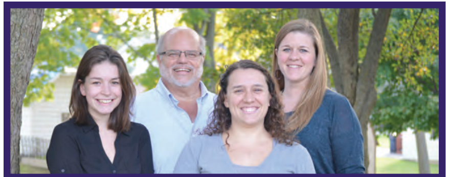
BVS Staff - 2018

What is it about hardship and struggle that makes an experience like BVS so formative? Story continued on page 2.