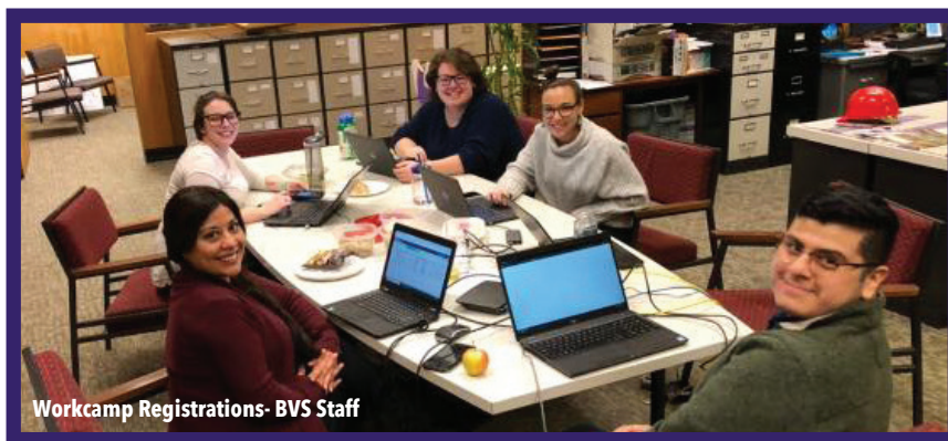
Workcamp Registrations- BVS Staff

In the small town of Lititz, Pennsylvania, life feels calm. I moved home in mid-March when our office temporarily closed. While the fast pace of office work continues, the small bubble I work in stays the same with my two furry pups and a large cup of coffee. As the news of COVID-19 evolves, so, too, do the exciting creations that are coming from the workcamp office. Social media live streams, singalongs, and plans for virtual workcamps are underway. While the world changes, the best thing to do is find highlights in the life that is happening now. There has never been a better time to try new things out of your comfort zone. So, we cuddle up with our loved ones and continue to work with just as much drive! 🌿