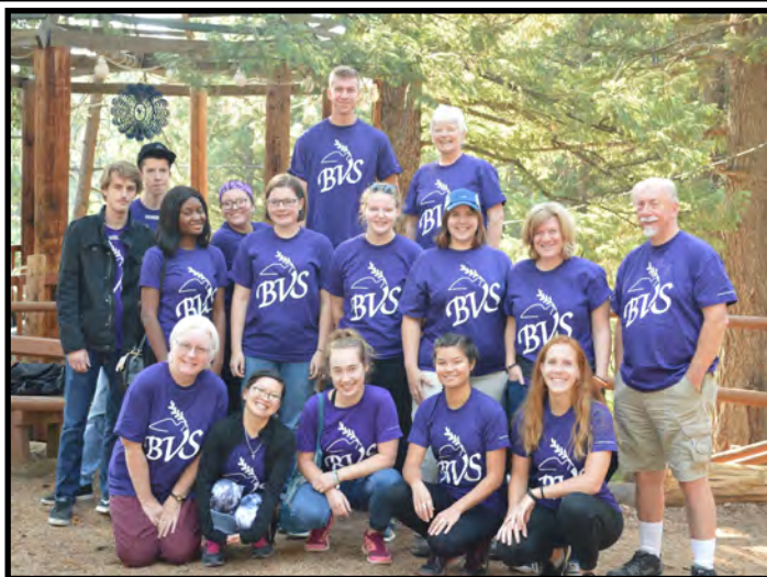
Unit 319, Summer 2018: Volunteers take a group photo in front of the gazebo at Camp Colorado before a work day in the community.