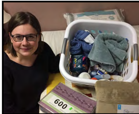
BVSers at Good Samaritan Services