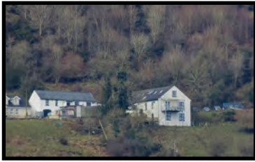
Quaker Cottage: the house on the hill