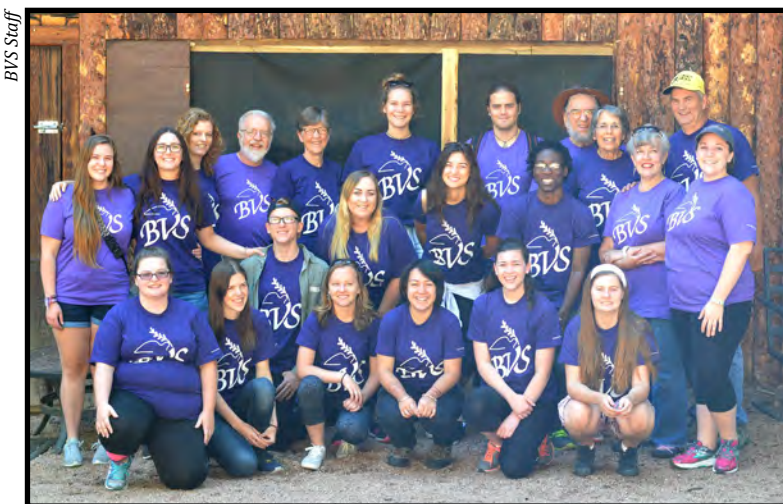
Unit 316, Summer 2017: Volunteers take a group photo in front of the lodge at Camp Colorado before a work day in the community.