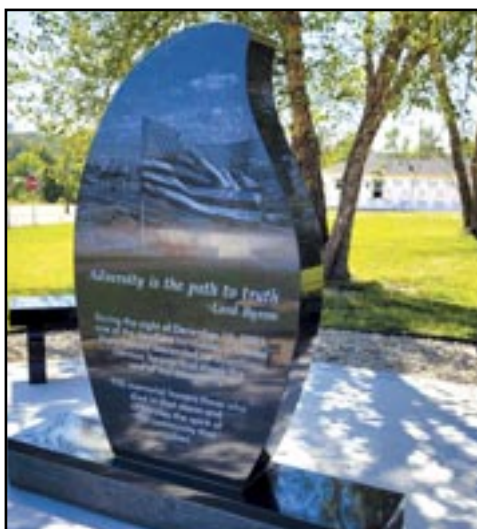
Dawson Springs, Ky.: This memorial to the community members whose lives were lost in the 2021 tornadoes can be seen from many of the homes that BDM is working to build back in the town.