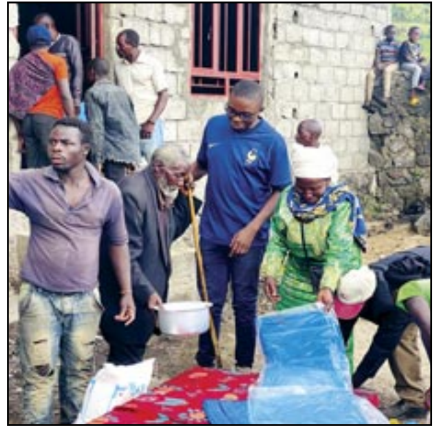
This vulnerable newly displaced elderly couple were very grateful to receive assistance after fleeing the fighting in North Kivu, DR Congo.

320 vulnerable families (2,560 men, women and children) who had been recently displaced. The grant provided corn meal, beans, vegetable oil, salt, and soap. Each household also received two pots, plates, cups, a mattress, and a tarp. One elderly couple remarked, “We are deeply touched by your help. These ... items are a ray of hope in our difficult reality. Thank you from the bottom of our hearts for this assistance, which is helping us regain a semblance of normalcy despite the challenges we face.”