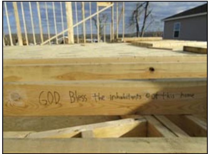
Volunteers pray for future homeowners and often write prayers, Bible verses, and messages of hope on the lumber framing the structure.

On one site, a household leader learned that their brother-in-law was gravely ill, and the family was traveling with the expectation that he did not have long to live. When the volunteers heard this, they paused their work and gathered to pray. They continued to pray each day on the job sites after reports were received. Not only did the