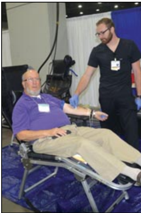
Donating blood at the 2023 Annual Conference

Not attending the Annual Conference in person? No problem! Once again a Virtual Blood Drive will be available for anyone wishing to join in the blood donation efforts by