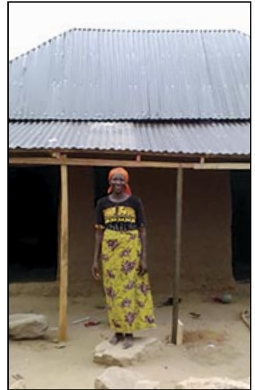
Providing new roofs for repaired houses is a major program of the Nigeria Crisis Response.

This year is also the beginning of a phasing out of the crisis response programming. Current plans are for a reduced budget in 2025, and a further