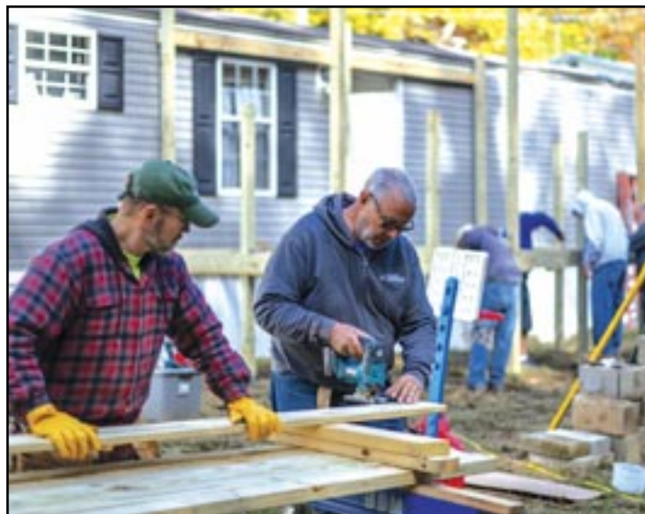
Volunteers on the Eastern Kentucky rebuilding site built decks for families whose homes were damaged by flooding.

Some of the families whose homes were repaired have owned the properties for generations, dating back to the late 1700s. They welcomed and appreciated BDM’s presence and work. The daughter of one homeowner, who