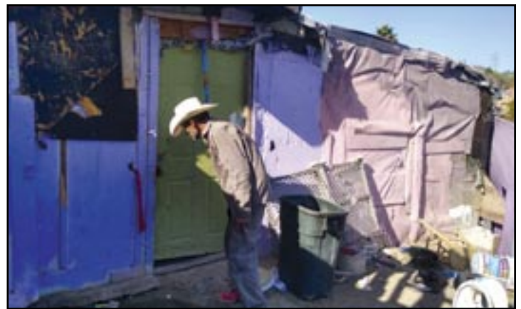
This home became unlivable after damage by Tropical Storm Hilary.

The guesthouse is surrounded by substandard housing which was especially susceptible to damage by the unusual heavy rains and winds of TS Hilary. Bittersweet Ministries chose to help four of its most vulnerable neighbors with their recovery by repairing three roofs and by building a new simple home for one family (a single mother with three children) whose patched together home became unlivable.