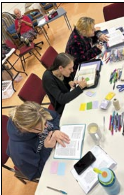
These BDM volunteers studied scripture in the evening on the Eastern Kentucky rebuilding site.

Volunteers learn and improve many new skills when they serve on a BDM rebuilding site. It is our hope that the prayer life of all those connected with the ministries of BDM will also be strengthened and that their conversations with God will develop as well.