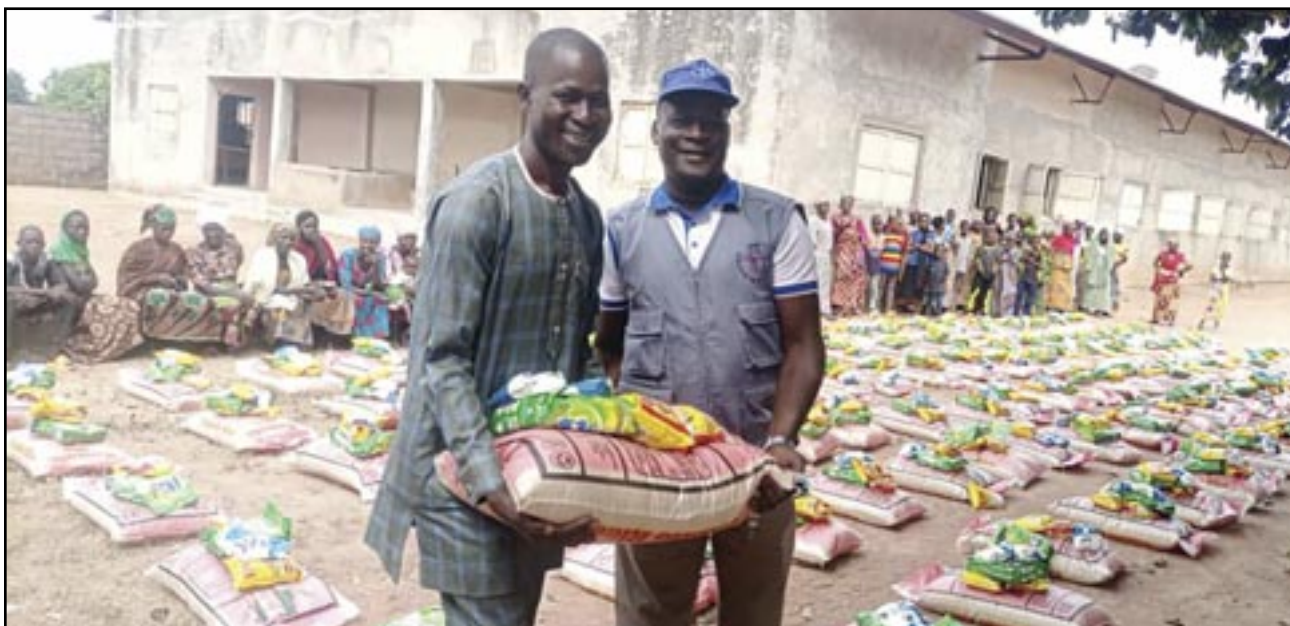
Some communities continue to experience violent attacks, including loss of crops, and are still in need of food assistance.

reduction in 2026. At the end of 2026, the formal joint Nigeria Crisis Response program of BDM and EYN will end. EYN will still be welcome to submit Emergency Disaster Fund (EDF) grant requests for specific disaster response programs. Any continued donations to the NCR will support EDF grants for EYN.