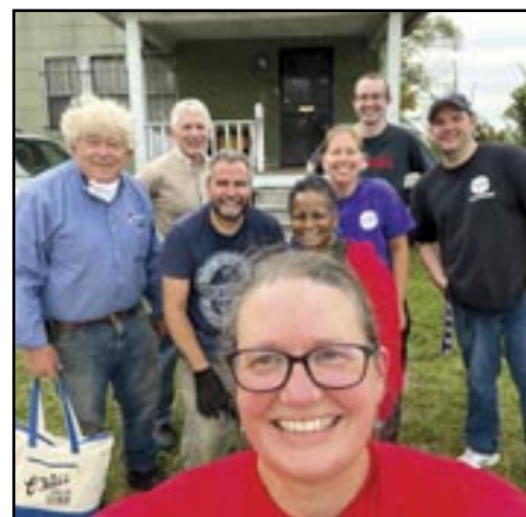
Volunteers from Living Peace Church (Michigan District) removed flood-damaged carpet and other items from this house in Detroit.

A group of five volunteers from Living Peace Church (Michigan District) participated in a Fall Clean-up Blitz in Detroit, Mich., on Saturday, Oct. 4, 2023. BDM staff connected the church with the After the Storm-Metro Detroit Flood Recovery Project for this