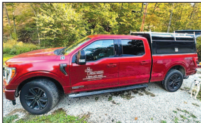
One of the new F-250 hybrid trucks on the Eastern Kentucky rebuilding site, October 2023.

BDM recently purchased two new trucks (one red and one charcoal) to be used on the rebuilding sites for transportation of volunteers and materials. Both trucks are 2021 Ford F-250 Hybrids with extended cabs, caps for the bed, and low mileage. One truck replaced a BDM van which was totaled after being hit by a truck in the parking lot at the Brethren Service