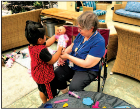
Play in CDS care centers is imaginative and child-led.

boosted by significant straight-line winds, quickly spread on Aug. 8, 2023, to engulf a large part of the town of Lahaina, consuming hundreds of homes in a matter of minutes. With nearly 100 casualties, this was the deadliest wildfire in the US since 1918 and the deadliest wildfire or natural disaster recorded in Hawaii since statehood. The trauma of surviving the experience, as well as that of losing family members, friends, property, and sacred cultural places and artifacts, was very real.