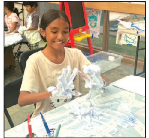
Hawaii: Tactile activities, such as playing with shaving cream, bring joy to children in CDS care centers.