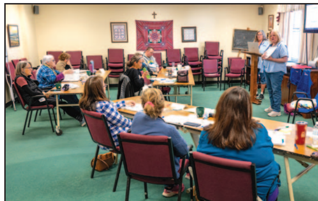
Participants in the CDS volunteer training workshop held at Bridgewater (Va.) Church of the Brethren learn how to care for children affected by disasters.

Mich. Trainings are scheduled in 2024 for Ankeny, Iowa (April 12-13) and Freeport, Ill. (May 3-4). Additional trainings are being planned. More information will be available soon. If you are interested in sponsoring a training in your area, please contact CDS at cgs@brethren.org .