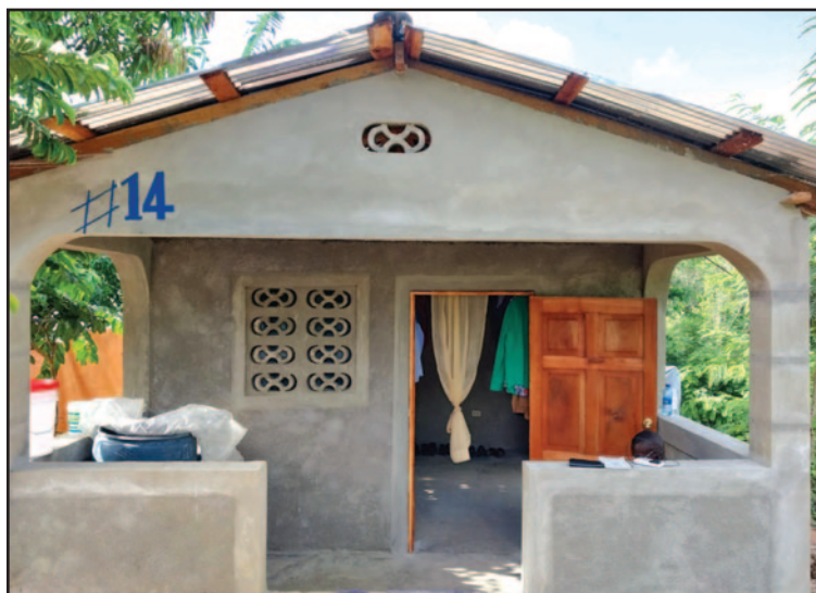
This completed home in Saut Mathurine, Haiti, is one of 26 being built for survivors of the August 2021 earthquake.