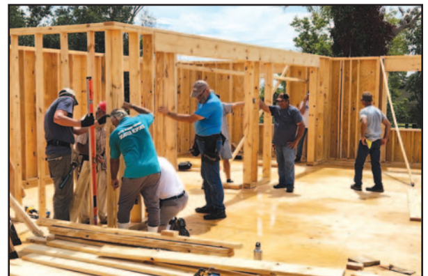
Volunteers frame a new house on raised pilings for a member of the Pointe-au-Chien community in Louisiana who lost his house during Hurricane Ida in 2021.