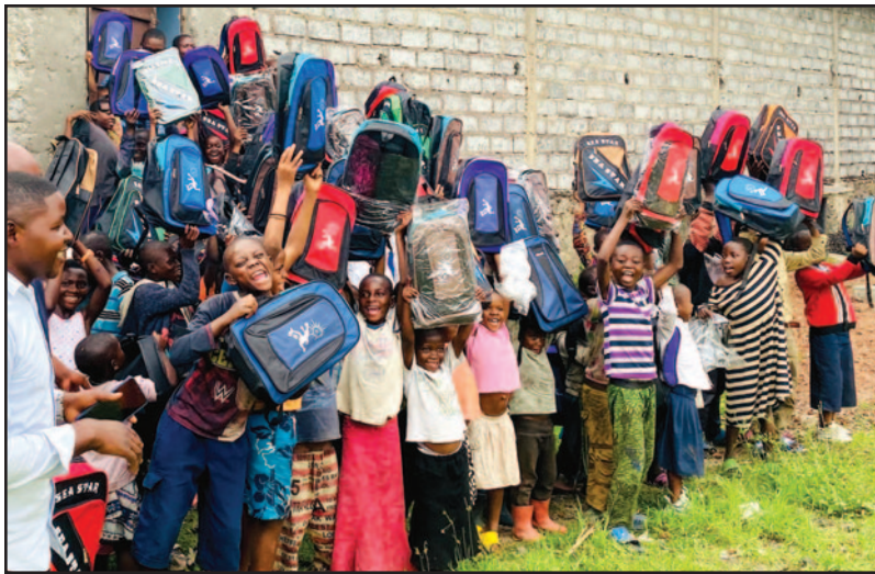
These children, who are internally displaced near Goma, DR Congo, were delighted to receive their new backpacks full of school supplies, distributed by Eglise des Freres au Congo through an EDF grant.