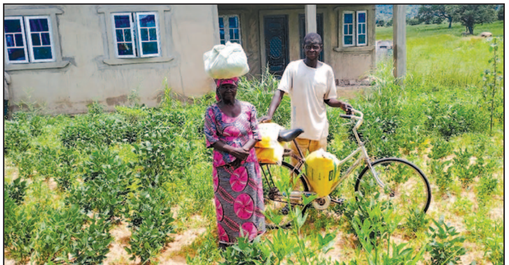
Members of the Dille community receive food and household relief items from EYN (Church of the Brethren in Nigeria) through the Nigeria Crisis Fund. Dille, in Southern Borno State, continues to face attacks by Boko Haram, preventing farmers from tending to their fields.

Alongside these celebrations, and for several more years to come, the Nigeria Crisis Response (NCR) continues the mission of supporting and equipping Nigerian families displaced by ongoing violence, kidnapping, and terrorist activities. More recently, these efforts have been challenged by crippling inflation as high as 25 percent which, among other difficulties, limits giving to the church and raises the costs of relief supplies. The NCR continues to provide seeds, fertilizer, emergency food, livelihood programs, new water wells, and more for displaced families, including those living in six camps. EYN is committed to supporting the displaced families while also rebuilding churches, building new churches in areas where displaced members have settled, and supporting pastors and church leadership.