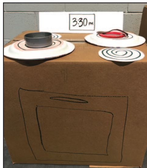
Imagination turns a box into a stove where "cooking" can bring a sense of comfort and familiarity and a recollection of times when children felt safe and cared for.

Child's play often reveals more than their delight in using their imagination. When you watch and listen to their kitchen conversations, you do find a "family". In our Maui CDS play kitchen, the children washed dishes slowly, seeming to enjoy letting the water flow in and out of the containers and wiping all sides and handles of pans. Boys flipped play pancakes in skillets with accuracy and pride. Girls wanted their meals served with a full set of utensils. They expected you to eat slowly and talk in detail about spices. They mentioned that their father was a chef or their grandma made banana pancakes. When the crowd of children "cooked", there was harmony and