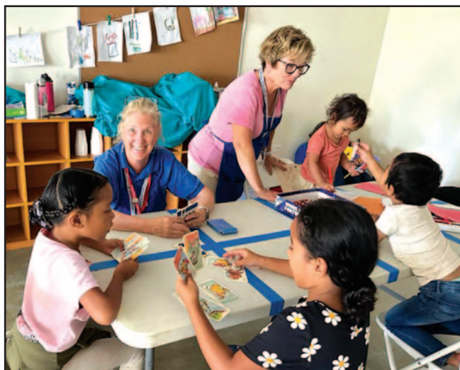
CDS volunteers in Guam played with and encouraged children of all ages.

The second major deployment for CDS was to Maui, Hawaii, where wildfires,