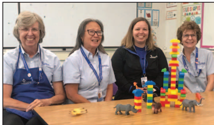
This CDS Critical Response Childcare team provided a safe space for children affected by the mass casualty event in Gilroy, Calif., in 2019. As one volunteer remarked about her CDS service: "Working with other people who are passionate about making a difference is very rewarding."

We just tried to make our little corner of the world a happy, safe place with bubbles, clay, blocks, magnets, and all the interesting things we do. Most of the children adapt very quickly—probably relieved to be away from the intense stress. I would volunteer again in a heartbeat!