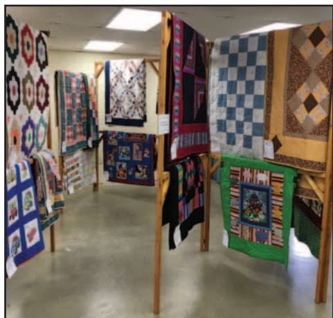
Quilts ready to be auctioned off at the 2019 Mid-Atlantic Disaster Response Auction

Brethren Disaster Ministries benefits greatly from the proceeds of several annual disaster relief auctions and other fundraisers and we truly appreciate those who give of their time and talents to make these events a success.