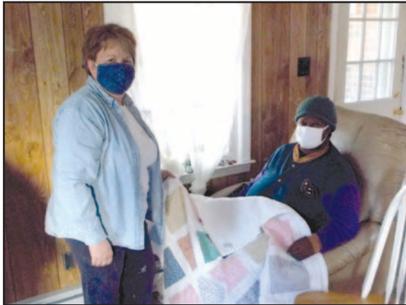
Miss Betty's house blessing

2021, three new house blessings took place, bringing survivors home over 28 months after Hurricane Florence damaged their houses. This Coastal NC project is scheduled to continue, with extensive COVID-19 protocols in place, through April of 2021.