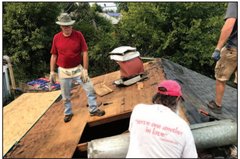
By Sammy Deacon and courtesy of BDM