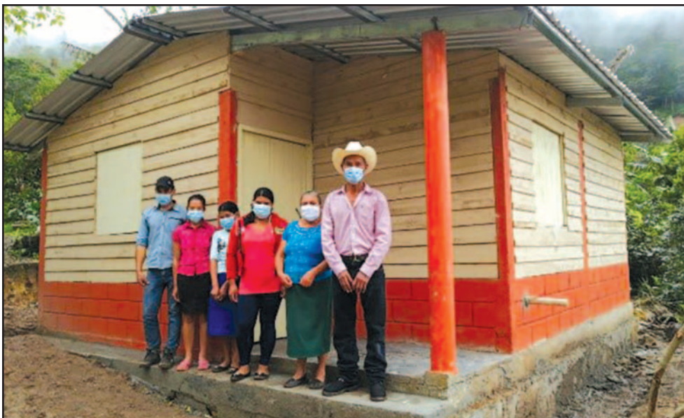
New efficient homes are being built in flood-free zones in Honduras by Proyecto Aldea Global (PAG) for families whose homes were destroyed in Hurricanes Eta and Iota.

BDM plans to work with partners like CWS and PAG in 2021 to expand the hurricane response to focus on home rebuilding, agriculture, and