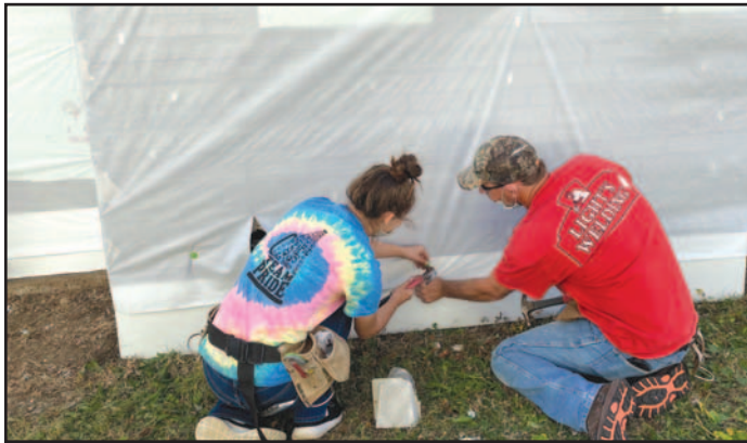
Much of the tornado recovery work in Dayton involves repairing siding and roofs that were damaged by the winds.

BDM has received a $17,000 grant from The Dayton Foundation to cover the 2021 expenses paid to our volunteer housing facility at the Memorial Presbyterian Church.