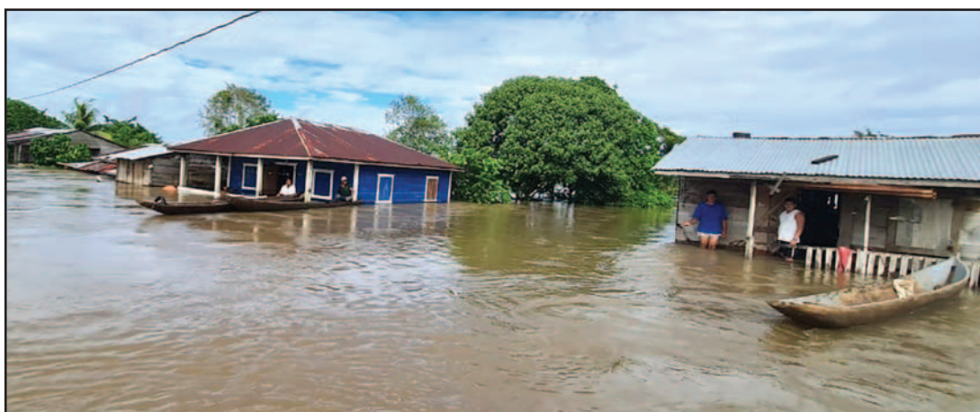
Hurricane Eta caused massive flooding in Central America.