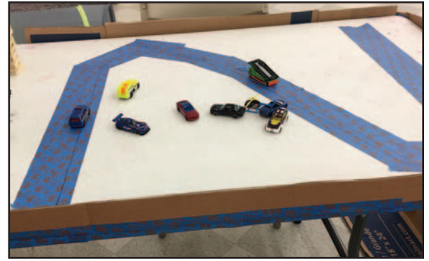
CDS volunteers use creativity and resourcefulness to create fun and secure childcare centers, sometimes in very small spaces. Everything has a potential use: boxes, blankets, table, chairs, walls, etc.