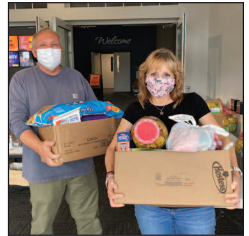
A COVID-19 grant supported the Ephrata (Pa.) Church of the Brethren food distribution program.