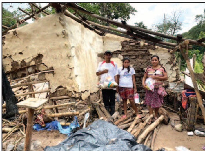
BDM partner Proyecto Aldea Global (PAG) quickly organized food distribution to areas in Honduras devastated by flooding following Hurricanes Eta and Iota.