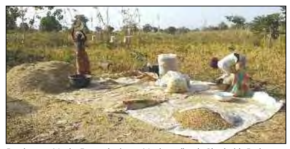
Bean harvest in Masaka: During a brief visit to Masaka, a village the Church of the Brethren built for displaced families, residents were busy harvesting and processing beans. Located outside of the capital Abuja, these farmers are teaching the locals how to grow crops and survive off the land. The community has built a temporary school and has partially constructed a church. Here, women in Masaka shell and winnow their bean harvest.

In order to avoid travel around the time of the February Nigerian federal elections, the 2019 annual tripartite meeting was held early at the Jos Technology Center in December 2018. Attending were 11 participants from the three response partners: Ekklesiyar Yan'uwa a Nigeria (EYN,