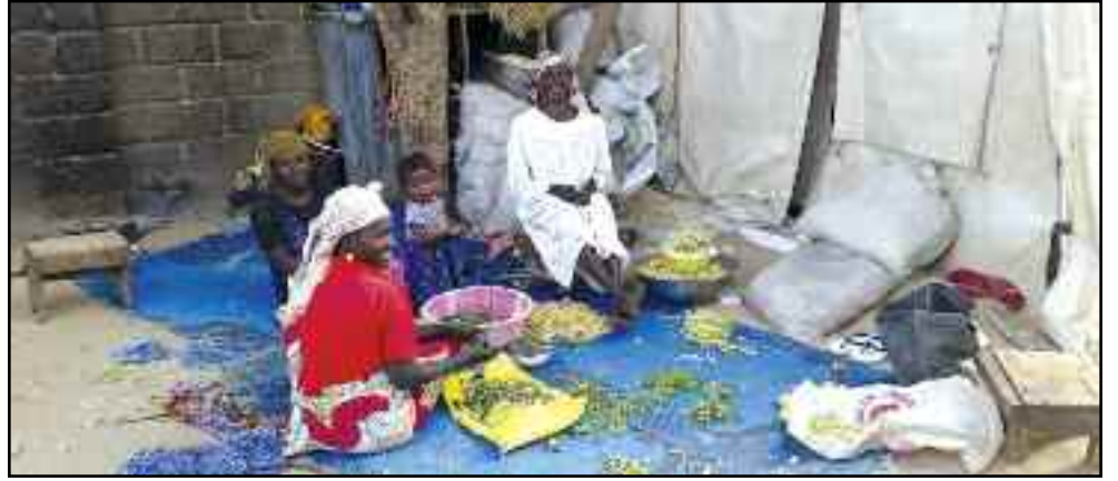
Despite the hardships, women laugh while preparing a meal in a camp in Maiduguri.