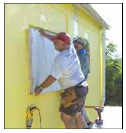
BDM volunteers painted the exterior and installed storm shutters on this St. Thomas (USVI) home in December 2018.

to load up in vans bound for different neighborhoods to be part of reconstructing homes and hearts. As we worked on patio doors, gutters and roofing, shutters, painting rooms and more, all of us could sense through conversations with owners and each other that as we pieced back together houses, we pieced back together lives. The local iguanas and dogs watched as owners came by grateful to see many things coming together. Our hearts were filled each day as we experienced communion through literal work and also through shared breaks and lunch, (with the dogs, too!) Then we loaded up for "home", (the church hosting us), had showers, dinner and evening devotions. Throughout that week, all those working realized and commented that