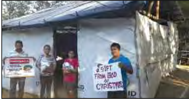
Top: Homeowners repaired their flood damaged homes as best they could. Bottom: An EDF grant brought assistance—just in time for Christmas.