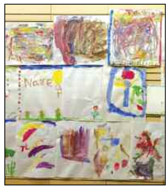
Children in the CDS childcare center chose darker colors and painted pictures mostly without form in the early days after the Camp Fire began.

CDS volunteers are specially trained to respond to traumatized children, providing a calm, safe and reassuring presence in the midst of chaos. After a traumatic event, children experience strong feelings, such as anger, fear, guilt and sadness, that can be hard for them to understand. Using non-guided creative outlets, children can work through their story and feelings in a child's most natural process: play.