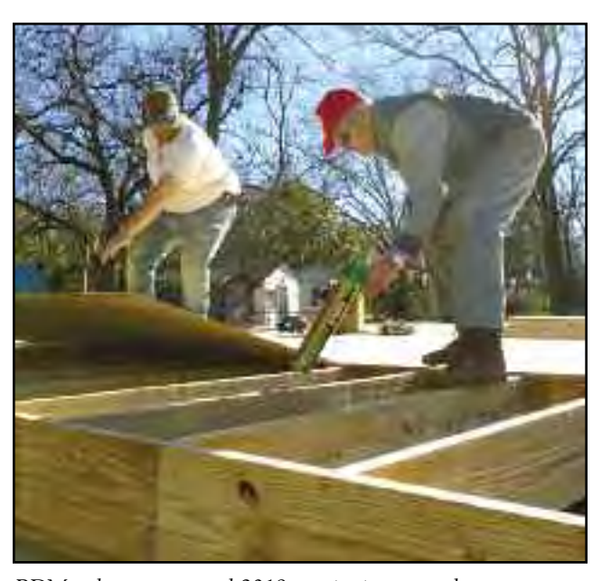
BDM volunteers started 2019 continuing to work on a new build in South Carolina as part of Hurricane Matthew recovery, despite new damage in the area from Hurricane Florence.

windows, ceilings, walls and a roof; painting; installing storm shutters; and rebuilding gutters and exterior stairs. The cases and volunteer housing came through a partnership with the St. Thomas Recovery Team (STRT), which was previously supported during its formation by Disaster Recovery Support Initiative (DRSI) staff. The volunteer support for the response in December was also supported by a $5,000 UPS Recovery Grant from National Voluntary Organizations Active in Disaster (NVOAD).