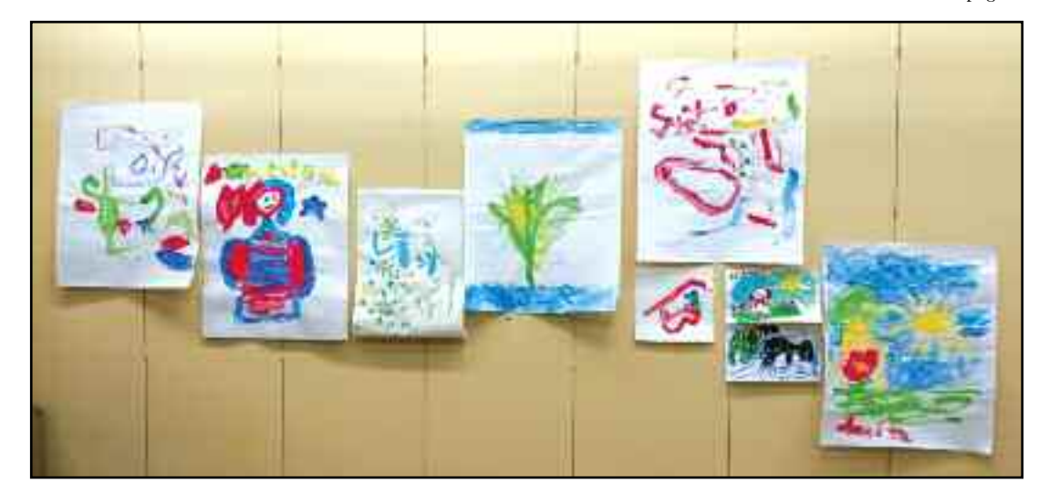
Pictures painted toward the end of the CDS deployment, several weeks after the Camp Fire was contained, are brighter and have recognizeable features.