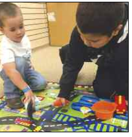
In the Disaster Resource Center for Camp Fire survivors in Chico, California, this boy exclaimed to his young companion, "Get the hammer, we gotta fix this town that got burned down by fire!"