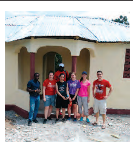
A group of young adults from Michigan helped to paint this home in Les Cayes, Haiti, built with support from the Hurricane Matthew Recovery Response.