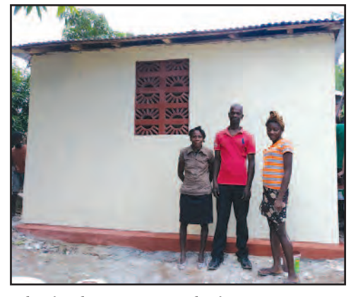
This family in Haiti was the first to receive a new home after Hurricane Matthew destroyed dozens of houses in their community.

The final wave of house construction through the Hurricane Matthew Response in Haiti began in May 2018. An additional $65,000 Emergency Disaster Fund grant is helping to build up to 12 new homes and provide repairs to 17 homes. This joint effort of BDM and the Haitian Church of the Brethren (Eglise des Freres Haitiens) began in the fall of 2016 after the hurricane caused extensive damage, flooding and more than 500 deaths.