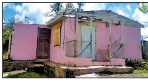
A Río Prieto house damaged by Hurricane Maria.

While progress is being made, we are challenged to help as many families as possible before the worst of the upcoming hurricane and tropical storm season arrives. We are challenged to maintain a response through the many years of recovery. We are challenged to not forget Puerto Rico, even as other disasters