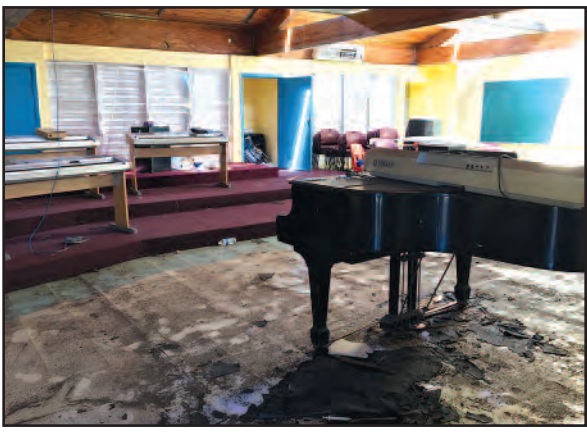
Hurricanes Irma and Maria rendered most of the buildings for one St. Thomas school uninhabitable, tearing off roofs and completely destroying all equipment inside.

If the above conditions are true, then the BDM national office can reimburse airfare as follows: twenty-