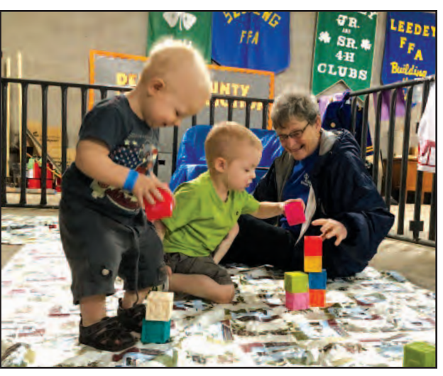
During the CDS response to Spring 2018 historic wildfires in Oklahoma, children enjoyed having a safe space to just play and 'be a kid' during stressful times for their families.