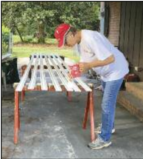
A volunteer paints molding for one of the first homes BDM worked on in Marion County, S.C.

In October 2015, heavy storms brought historic rainfall totals (almost 17 inches in five days) and caused wind and flood damage to homes in the Columbia S.C. area. BDM opened its rebuilding project in Columbia in October 2016. The project closed the last week of August 2017, and was moved to Marion County, S.C.