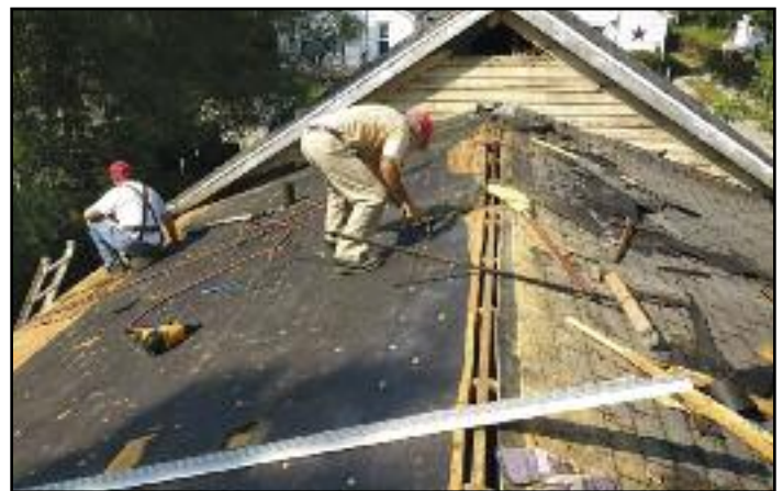
BDM volunteers from South/Central Indiana and Illinois/Wisconsin districts repaired a roof in Ottawa, Ill., damaged in February 2017 by an F-3 tornado. The team worked with the Ottawa/Naplate Long Term Recovery Group, which had formed with support from the Disaster Recovery Support Initiative (DRSI).