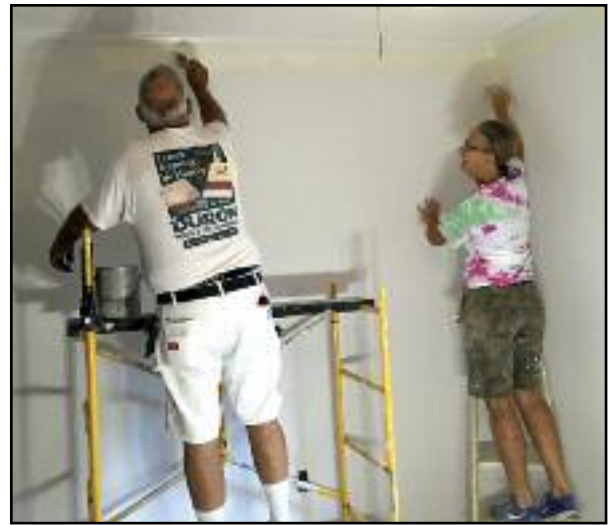
Volunteers paint walls in one of the first homes BDM worked on in Marion County, S.C.

From August through the middle of September, the DRSI team supported an area in Southeastern Wisconsin following a flooding event in July 2017. The DRSI team, working with the FEMA Voluntary Agency Liaisons, communicated with the local county and state leadership to discuss the formation, structure and function of a long-term recovery group (LTRG). The result was the formation of