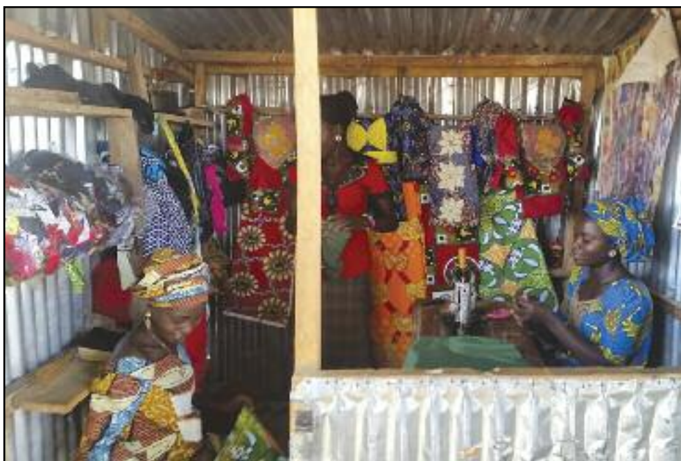
Livelihood training has enabled widows and orphans, like this woman, to earn a living and start on the path of self-sufficiency.