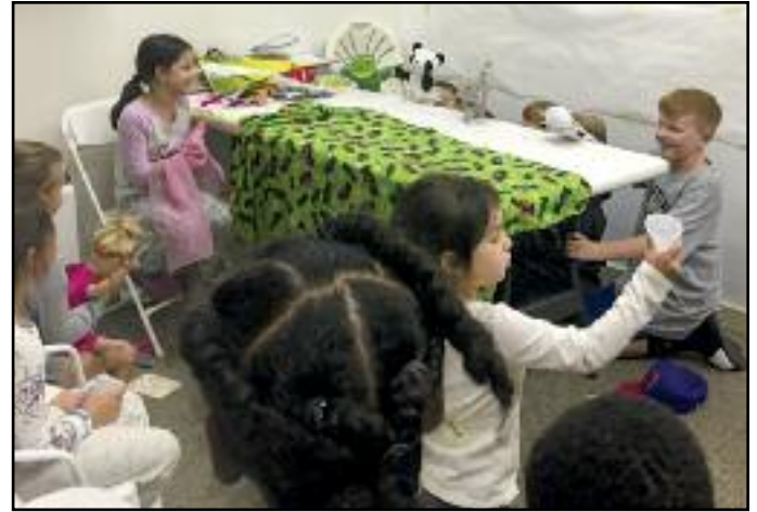
Children put on a puppet show for CDS volunteers in a Local Assistance Center during the California wildfire response.

We are also grateful for many other partners who supported this work in so many ways, including local and state governments, Child Care Aware of America, and Save the Children. And, of course, we could not do it without our volunteers who responded so capably, and to those who continue to be ready to respond.