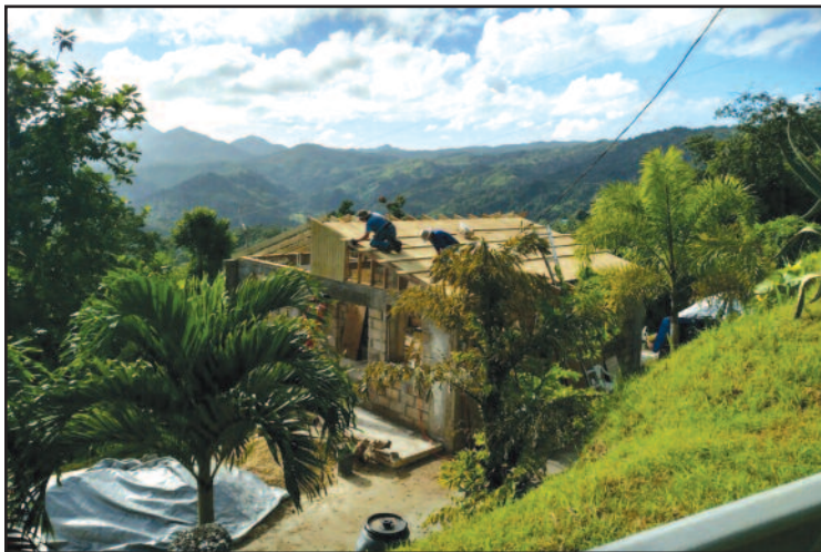
BDM volunteers work on the roof of a house in Puerto Rico that was mostly rebuilt after it was damaged during Hurricane Maria.

The bulk of the current response work involves building and securing metal roofs and treating homes for mold to create a safe living environment. Most of the building materials come through a special FEMA (Federal Emergency Management Agency) program called VALOR, at no cost to the homeowner or BDM. Hurricane Maria also had a major impact on employment and farmers. The COB's Global Food Initiative and BDM are working together to support farmers to recover, plant new crops and in turn support the employment of farm workers.