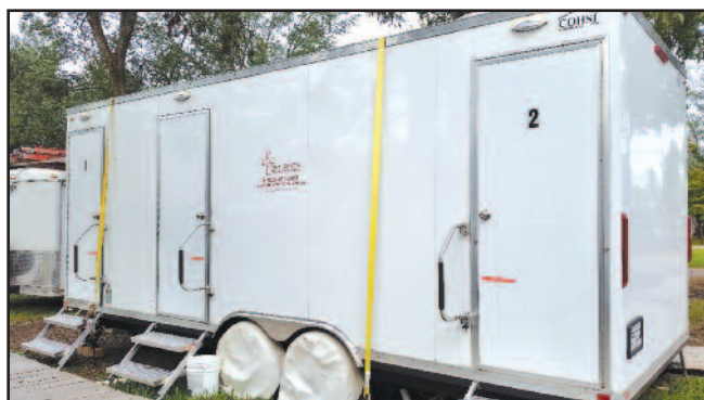
With Hurricane Florence headed toward Lumberton, N.C., BDM project leaders strapped down the shower and other trailers and moved vehicles to lots with fewer trees.