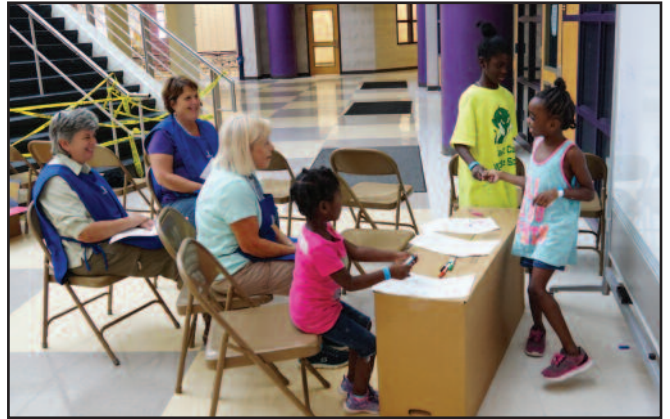
CDS volunteers play "school" with children at a school in North Carolina that served as a shelter for families affected by Hurricane Florence.

At the request of the Maryland Department of Human Services,