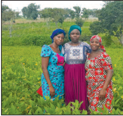
Members of the women's Victory Soybean Cooperative near Abuja, Nigeria, work together to become self-sufficient.