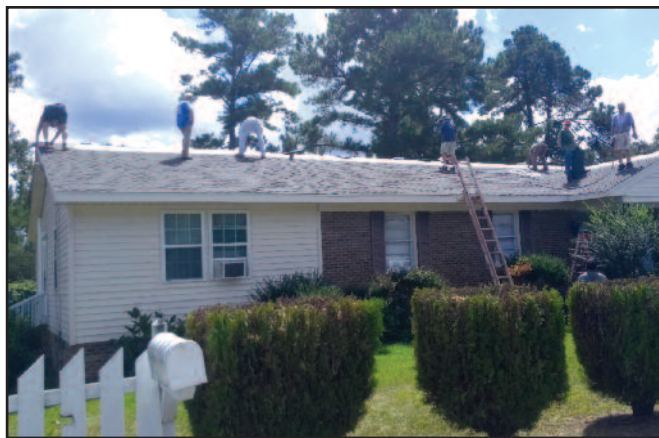
North Carolina: A double crew of BDM volunteers race to complete this Hurricane Matthew damaged roof before the arrival of Hurricane Florence.