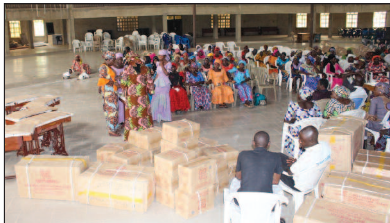
These women have completed their training and are eager to receive their sewing machines so they can support themselves and provide a needed service to the community.