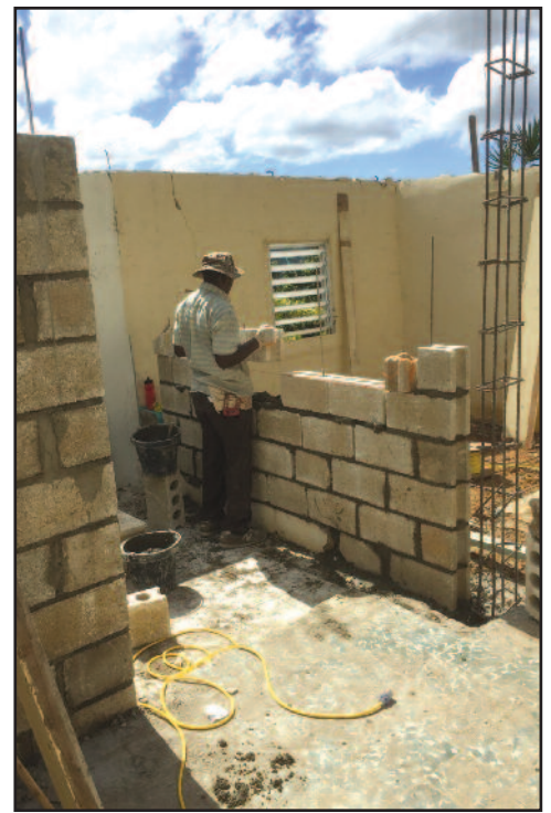
God's timing: Volunteers from the Church of the Brethren in the Dominican Republic had the exact expertise needed to rebuild this home damaged by Hurricane Maria.

The Puerto Rico project is not a typical BDM project in many ways, particularly due to the daily challenges. Like many communities, Castañer continues to struggle with unreliable water and electricity. Communication in Spanish can be a challenge