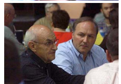
Delegates engage in conversation and prayer during the Compelling Vision Process sessions.