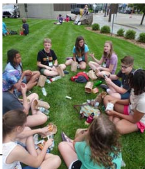
Children at a picnic (left). A Conference-goer gets free ice cream for completing a Passport to the exhibit hall (center). Nigerian Brethren at an insight session.