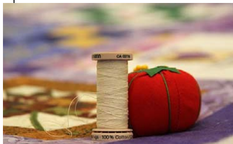
The Conference quilting bee.

Delegates did not approve a Review and Evaluation recommendation for a gathering of denominational leadership.