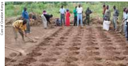
Care of Creation Kenya

The latest grants of the Global Food Crisis Fund are to the Church of the Brethren in Haiti for water conservation on the island of La Tortue (La Tortuga in Spanish) and to Care of Creation Kenya for construction of a tree nursery in Kenya's Rift Valley. Each grant was $4,000. Over the past 20 months, GFCF has awarded 25 grants that totaled over $585,000 for food security programs in 13 countries.