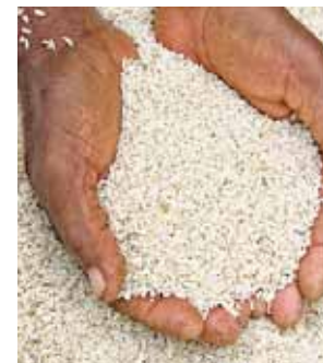
Bread for the World

Religious and humanitarian agencies offering an array of informational and inspirational resources on hunger on the Internet are the following: Bread for the World, www.bread.org . Church World Service, www.churchworldservice.org . ECHO (Educational Concerns for Hunger Organization), www.echonet.org . Foods Resource Bank, www.foodsresourcebank.org . Heifer International, www.heifer.org . Millennium Development Goals, www.un.org/millenniumgoals/ . One Great Hour of Sharing, www.onegreathourofsharing.org . SERRV, www.serrv.org . World Food Day, www.worldfooddayusa.org . World Food Prize, www.worldfoodprize.org .