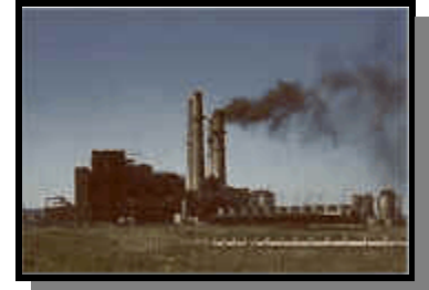
Harmful pollutants being pumped into the air.

But don't stop there! As an individual you can take steps to help the environment and be more fuel-efficient. Consider these changes in your daily routine: