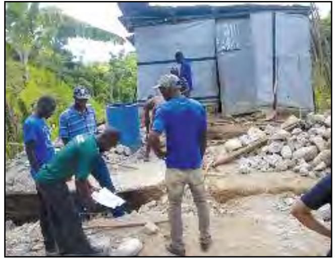
Hurricane Matthew recovery continues in Haiti with home reconstruction. Working in partnership with the Haitian COB, BDM is supporting the repair or rebuilding of 40 homes damaged by the 2016 hurricane. In this photo preparations are underway to build a house for a family currently living in makeshift housing.