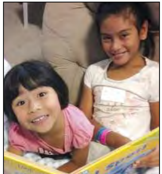
Children forced to flee their homes by wildfires enjoy reading books and relaxing in a donated rocker in a shelter in Ventura, Calif.