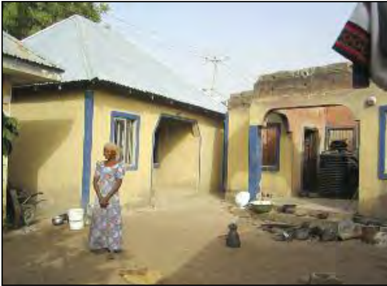
The Nigeria Crisis Response supports the most vulnerable EYN families as they return to their damaged homes. The house on the left received a new roof after the family repaired the structure. Damage to the house next to it is an example of the long journey to recovery that families in Northeast Nigeria still face.