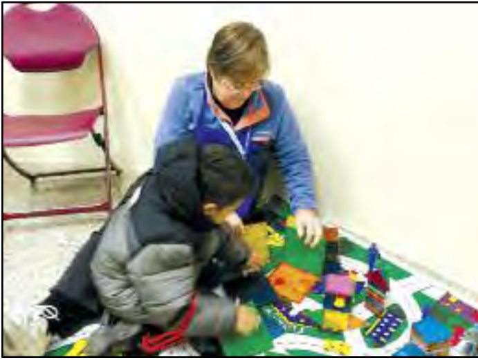
Families evacuating from Puerto Rico to Philadelphia, Pa., after Hurricane Maria, were directed to Disaster Assistance Service Centers where CDS volunteers cared for the children while parents applied for assistance.