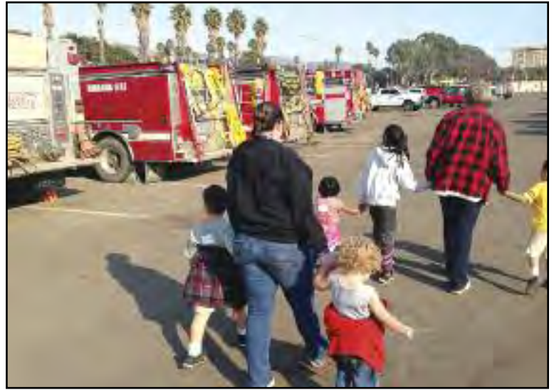
Children being cared for by CDS volunteers in Ventura, Calif., during the wildfires, visit emergency vehicles outside of their shelter and interact with first responders (below).