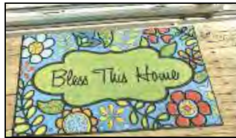
The doormat of a young family's new home in Eureka, Mo., expresses the hopes and prayers of the volunteers who served them and the local community who will continue to support them.

Another amazing story of hope and survival involves a couple who have three children under the age of five. They had previously lived in a mobile home that flooded twice and was finally demolished. They were living with the husband's parents temporarily, with no resources to rent or purchase their own home. Because of the work of BDM volunteers and local organizations, this family was able to