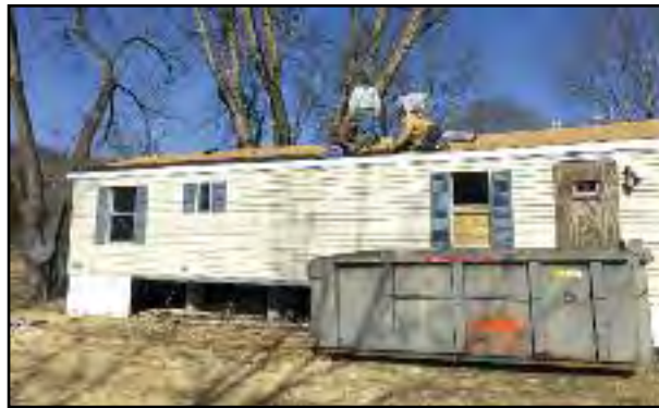
Volunteers repair a roof in a trailer park in Eureka, Mo. Families whose own trailers have been continually damaged in repeated flooding are being moved from the floodplain to repaired homes in this new location.