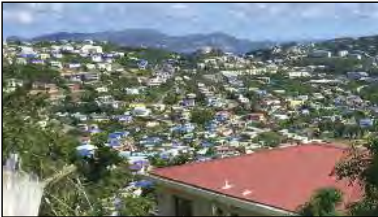
This view of many blue tarped roofs in December 2017 on St. Thomas, U.S. Virgin Islands, shows the widespread damage caused by Hurricanes Maria and Irma.