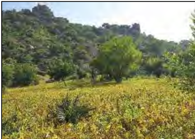
A field of soybeans in Nigeria near harvest. The Soybean Value Chain Initiative, supported by the Nigeria Crisis Response, has already reached over 100,000 farmers with information about this crop which improves both household nutrition and income.

The vehicle for COB emergency and recovery support, in partnership with EYN, is the Nigeria Crisis Response, which began in 2014. By the end of 2017, nearly $5 million had been expended for programs through EYN and five Nigerian non-governmental organizations, beginning with emergency support and, as areas became more secure, expanding to help families rebuild their homes and lives, and recover their self-sufficiency. Violence has