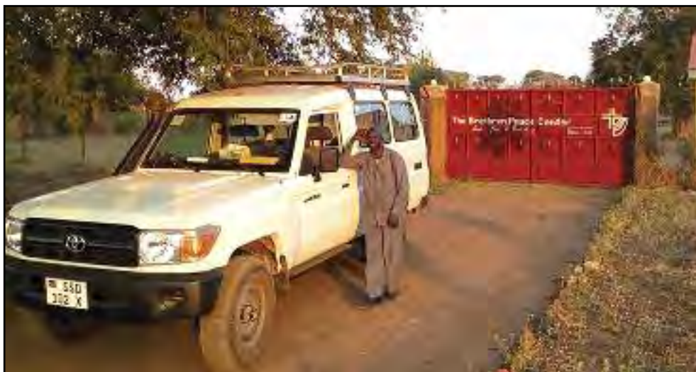
Years of violence between government troops and militias (who protest the “corrupt” government by raiding villages for food and supplies) are an ongoing situation which leaves thousands of Congolese homeless and hungry. Partnering with the Congolese Church of the Brethren, Emergency Disaster Fund grants have provided emergency food and supplies for these displaced families.