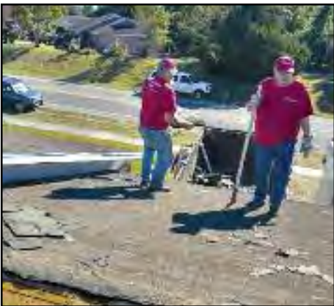
Daytona, Fla.: A team of BDM volunteers work to repair a roof damaged during Hurricane Matthew.

Currently, the most likely location for the Eureka, Mo., site to move to is